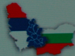
Bulgaria – Serbia IPA Cross-border Programme

The project "Balkan Consumer Bridge" is co-funded by EU through the Bulgaria–Serbia IPA Cross-border Programme.